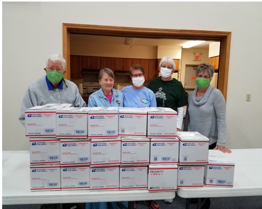
Sent about 25 college/active military boxes for Christmas

A cherished tradition of the United Methodist Women is the preparation of Christmas cookie plates to share thanks and cheer! The UMW met on December 9 to assemble about 85 packages of homemade goodies for community members! On December 2, 25 college boxes were also readied to go to exam-stressed students, as well as active-duty military. We are grateful we could complete these projects in this unusual year of 2020!